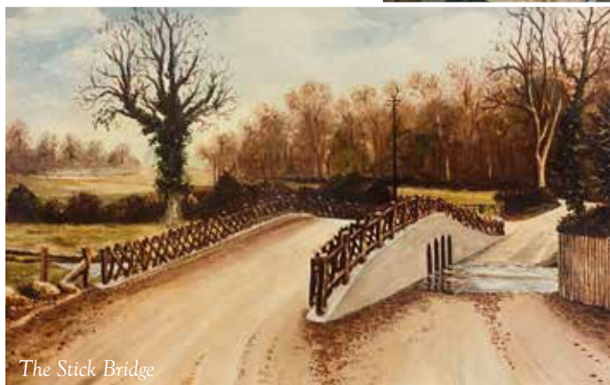
The Stick Bridge

In addition to the paintings there are numerous fascinating maps of Costessey and the surrounding areas, many of them dating from the mid 19th century. As they are extremely large this makes displaying them a challenge and to help we are hoping to get a map desk with drawers of sufficient size to make access easier. We are also looking to find ways of wall mounting some maps safely to give a glimpse of Costessey as it was 150 years ago.