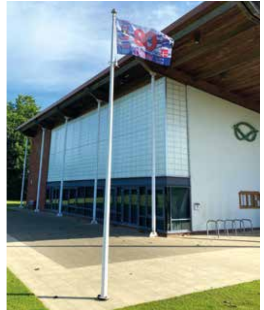
To mark the occasion we changed our flag to a special D-Day edition.